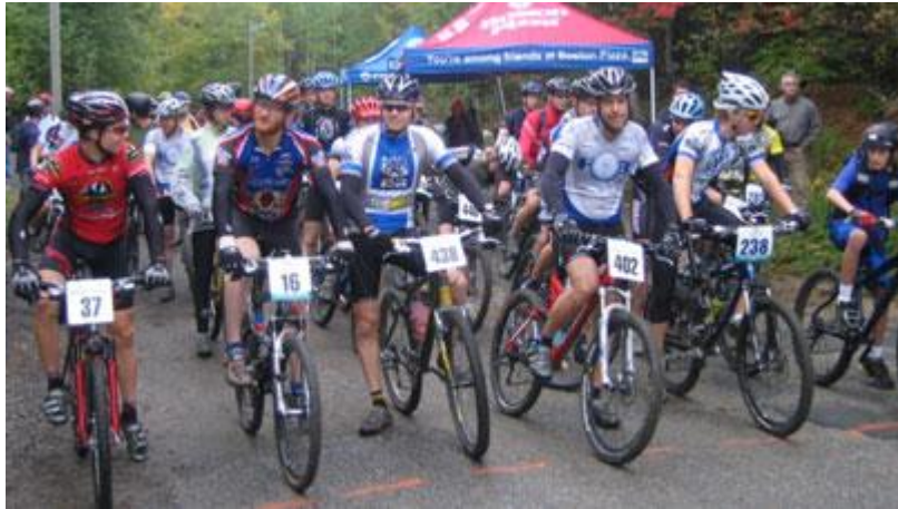
START LINE INAUGURAL 4 HOURS OF FRENCH FORT COVE 2006